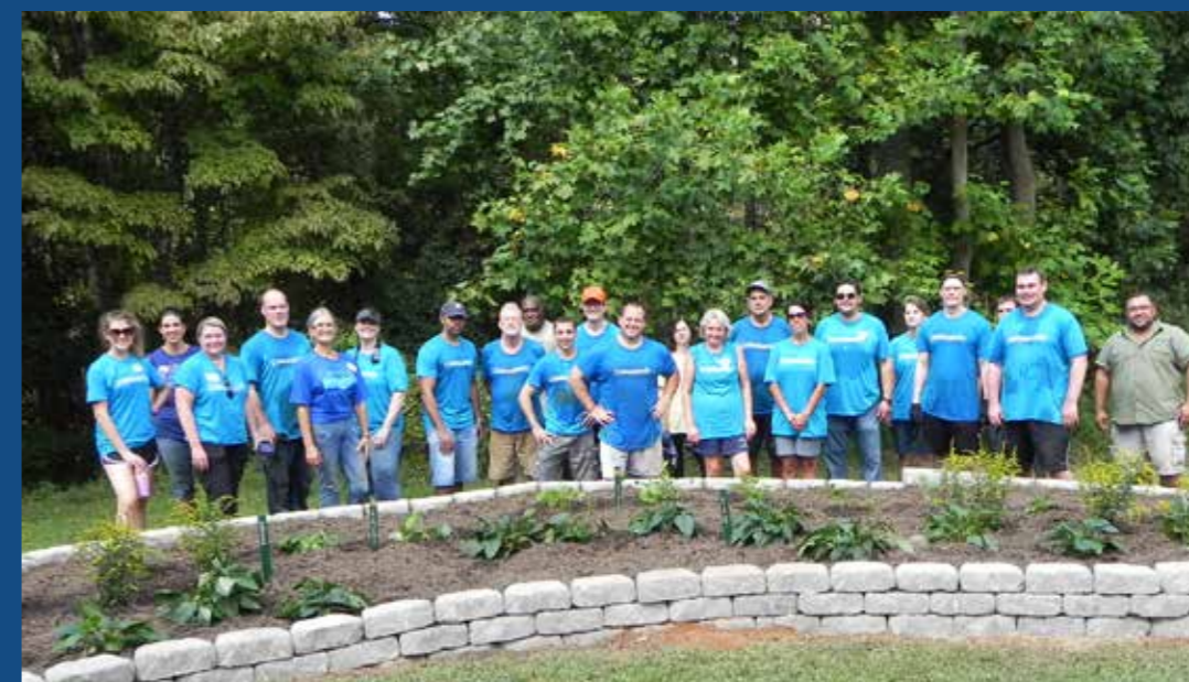
Volunteers from Daimler Truck Financial and staff from Mecklenburg County Parks Rec helped install a new ozone garden at McDowell Nature Preserve.

Building partnerships to keep an eye on the safety of our most vital natural resources.